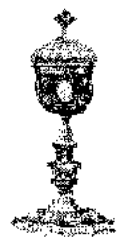
"At the Elevation: Contemplate Jesus hanging on the cross, and adore the same Jesus here present on the altar; say with the utmost reverence and devotion:

"At the Elevation of the Sacred Host: O Jesus, my Saviour, I believe that Thou art truly present, as both God and man, in this blessed Sacrament... At the Elevation of the Chalice: O Jesus, I adore Thy sacred blood ... Hail, divine and adorable blood..." Holy Souls Book , p. 221