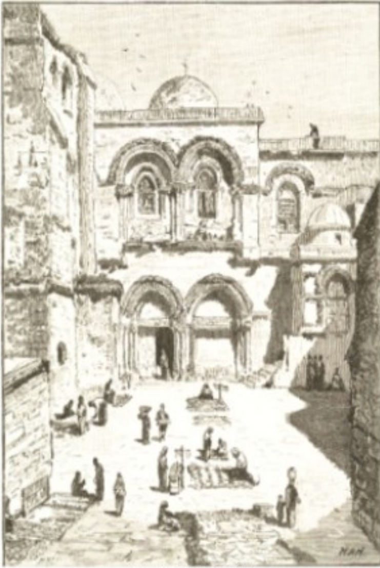
Entrance to the Church of the Holy Sepulchre

Christian Street is specially the quarter of the Christian tailors, shoemakers, and other craftsmen. Passing about 200 steps along it, we come to a very narrow street on the right, running downhill, with a frightful causeway. Turning into this, you presently come to a few steps on the left, which your donkey, if you have one, makes no difficulty in descending, and you are then in the open paved space before the Church of the Holy Sepulchre. This is a favourite haunt of Bethlehemite sellers of mementoes in mother-of-pearl and olive-wood, which, with other trifles, are exposed on the pavement. At festival times the throng in this spot is curious in the extreme. Men and women, children and the very old, priests and laymen from every country, repeat the spectacle and the Babel-like confusion of tongues seen and heard of old in this very city on the day of Pentecost (Acts 2:8-11). The only entrance to the church is on the southern side, and it was shut when I reached it, but a gift to the door-keeper having turned the key, I entered. On each side of the quadrangle are chapels, Armenian, Coptic, and Greek, the last pretending to be the place where Abraham was about to offer up Isaac. The front of the great church itself is impressive from its evident antiquity. There were originally two round-arched gateways, but that on the right is built up, as is also the upper part of the other. Above these gateways