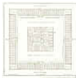
The Plan of the Temple