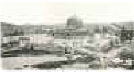
The Place of the Temple