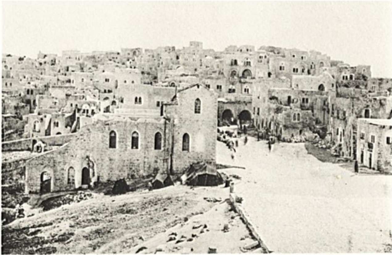
The Street of the Nativity, Bethlehem

silently stretched out their hands for alms; women with their white side veils and bright dresses passed and re-passed; open-air grocers displayed their wares; one turbaned figure sat amidst a show of broken and mended umbrellas; another watched over a collection of mouse-traps, which he very much wished to convert into piastres; a third fondly hoped you would invest in his figs, raisins, or oranges; a fourth had bread or cakes to tempt you. A few shops, faintly trying to look European, presented in the windows a varied collection of local mementos; and, of course, there were one or two places where thirsty souls might drink, though foreigners alone, I doubt not, sought any beverage stronger than coffee.