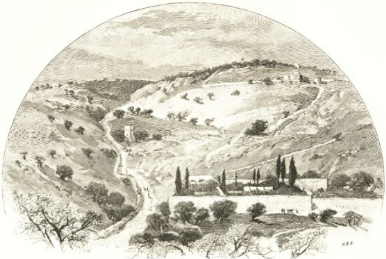
The Mount of Olives, with "Garden of Gethsemane" in foreground

sound to be heard in praising and thanking the Lord; and when they lifted up their voice with the trumpets and cymbals and instruments of music, and praised the Lord, saying, For He is good; for His mercy endureth for ever: that then the house was filled with a cloud, for the glory of the Lord had filled the house of God" (2 Chron 5:13,14). The heavenly and earthly Fatherland of the Israelite thus seemed here to fade into each other. Who does not remember the touching cry of the Jewish prisoner from the sources of the Jordan, on his way to exile? "As the hart panteth after the water-brooks, so panteth my soul after Thee, O God...For I had gone with the multitude, I went with them to the house of God, with the voice of joy and praise, with a multitude that kept holyday" (Psa 42:1,4). But peaceful as this place is now, and sacred as it was in its earlier days, how often has it been the scene of the most embittered strife, since the times of Solomon! The first Temple, with all its glory, had gone up in smoke and flames, amidst the shouts of Nebuchadnezzar's troops, after a defence which steeped the wide area in blood; and at the conquest of the city by Titus, thousands fell, within its bounds, by the weapons of the Roman soldiers, or perished in the flames of the third Temple, amidst shrieks from the crowds on Zion, heard even above the roar of strife and of the conflagration.