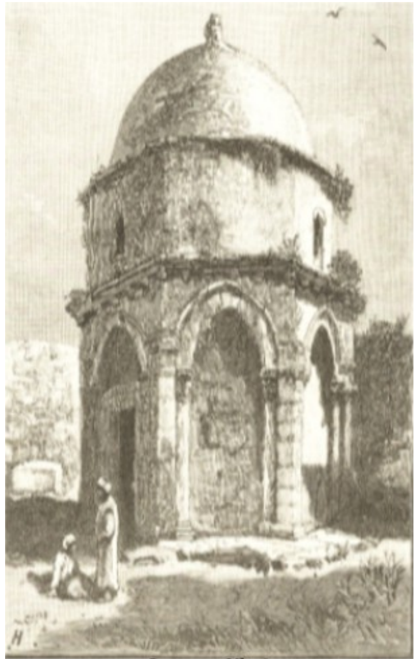
Dome on Olivet

There may be said to be three summits: the centre one slightly higher than the others, like a low head between two shoulders. This middle height is covered on the top with buildings, among which is the Church of the Ascension, though it is certain that Christ did not ascend from the summit of Olivet, for it is expressly said that He led His disciples "out, as far as to Bethany," and, moreover, the top of the hill was covered with buildings in Christ's day. From a very early date, however, it has been supposed to be the scene of the great event, for Constantine built upon it a church without a roof, to make the spot. Since then, one church has succeeded another, the one before the present dating from AD 1130, when it was built by the Crusaders; but this in turn having become ruinous, it was rebuilt in 1834, after the old plan. It stands in a large walled space entered by a fine gate, but is itself very small, measuring only twenty feet in diameter; a small dome over a space in the centre marking, it is asserted, the exact spot from which our Lord ascended. This specially holy spot belongs to the Mahommedans, who show a mark in the rock which, they tell you, is a footprint of Christ. Christians have to content themselves with having mass in the chapel on some of the great Church feasts. The church stands in the centre of the enclosure.