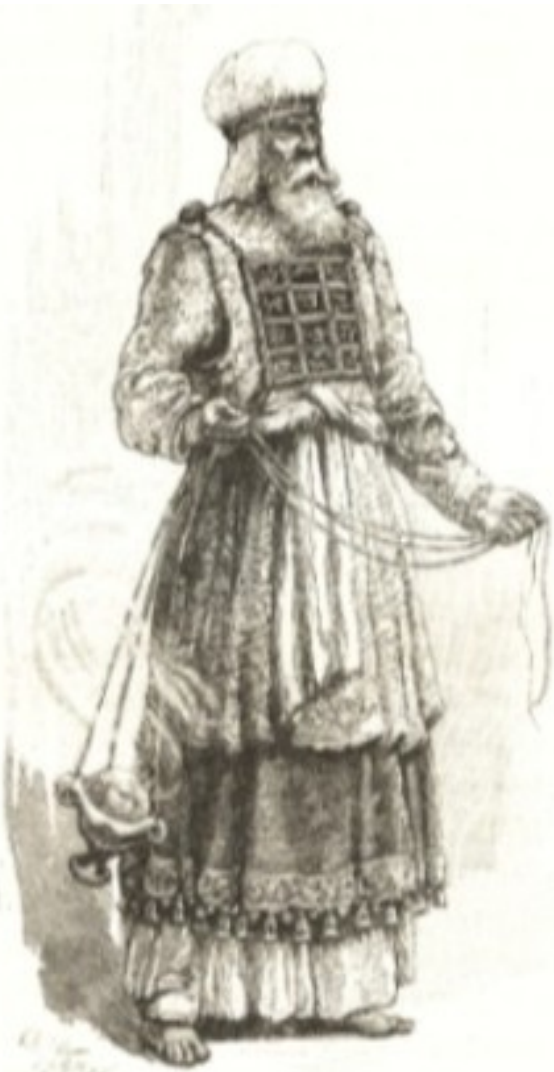
High Priest Wearing the Ephod

It was on the front of such an ephod that the Jewish high priest, in later times, wore the oracular Urim and Thummim. Thus Micah, in Mount Ephraim, "had an house of gods, and made an ephod and teraphim," which Jonathan, the apostate descendant of Moses, whom Micah had made his priest, carried off to Dan, and used there for idolatrous worship (Judg 17:5, 18:18-20). The ephod, indeed, is mentioned in connection with teraphim as late as the time of Hosea, just before the overthrow of the Ten Tribes (Hosea 3:4). The Danites evidently believed in the oracular power of such a combination, since the discovery of it in Micah's possession led them at once to the conclusion that they could use it to see what they were to do next, in their adventurous journey on the war-path in search of a new home (Judg 18:4,5). House-gods, in various forms, have always, indeed, been a great feature in idolatrous systems. Thus in the ruins of the great palace of Khorsabad, at Nineveh, Botta discovered under the threshold of the gates a number of statuettes in baked clay; images of Bel, Nergal, and Nebo, placed there, as an inscription tells us, "to keep away the wicked, and all enemies, by the terror of death."* Different parts of a house were placed under the protection of separate divinities; and a magic formula, which has been discovered, directs that a small image of one god ought to be placed at the court-gate of a house; of another, in the ground near the bed; of a third, inside