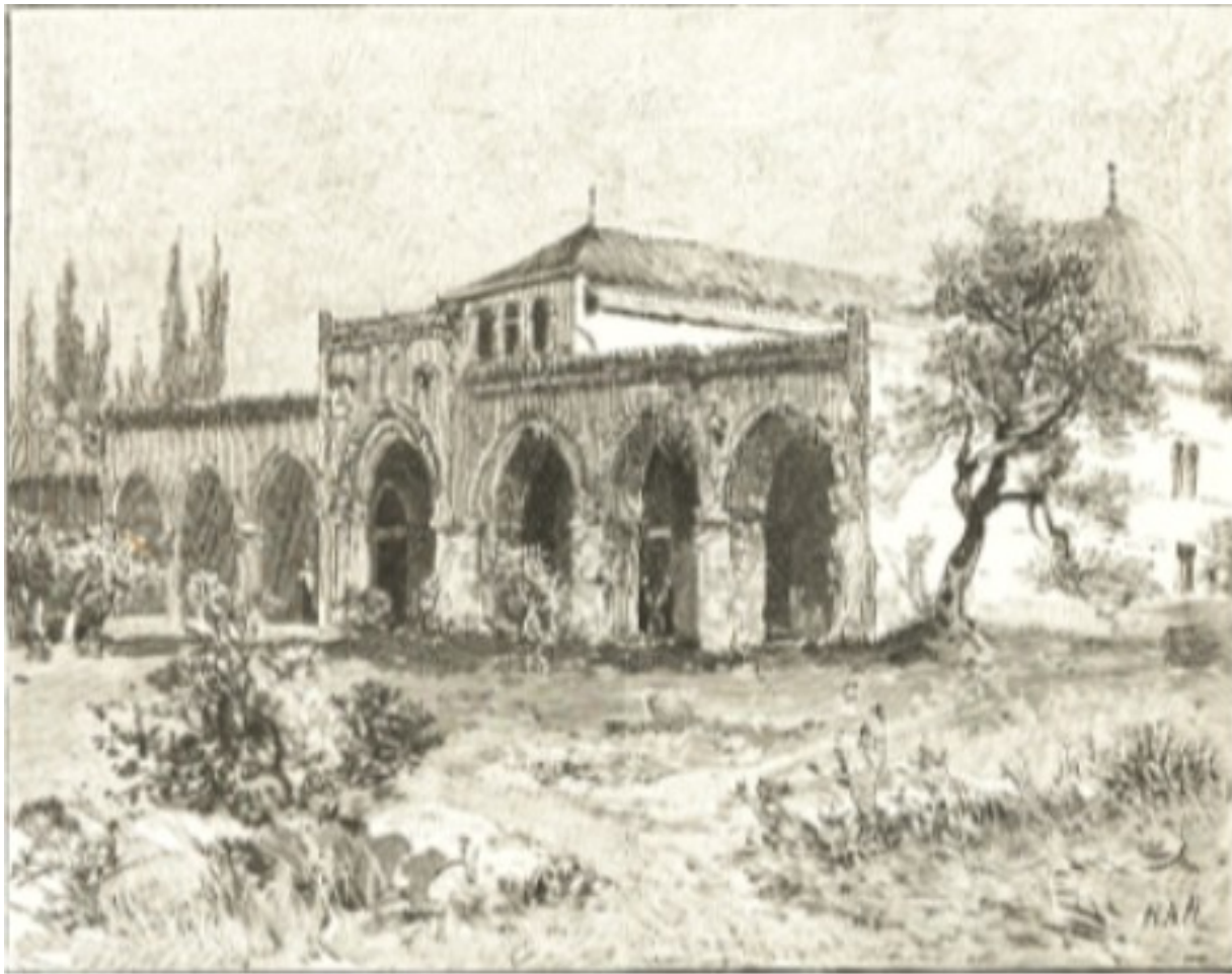
The Mosque El-Aksa

The Mosque el-Aksa, which stands at the south end of the great enclosure, was originally a basilica or church built by Justinian in the sixth century in honour of the Virgin. The noble facade of arches, surmounted by a long range of pinnacles, is, however, Gothic, and appears to have been the work of the Crusaders. Within there are seven aisles, of various dates, pillars a yard thick, dividing the nave from the side aisles, and a dome rising over the centre of the transept; but the effect of the