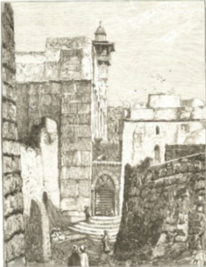
Entrance to the Mosque of Machpelah

thinking of the fact that Christians are not allowed to enter the sacred building. I had only got up two or three steps, however, when my ambitious career was brought to a stop, and I had to content myself with looking at a hole in the wall through which the poor Jews are permitted to thrust pieces of paper on which their names are written, in the hope that Abraham may see them and intercede in their behalf. What a strange thing is human faith!