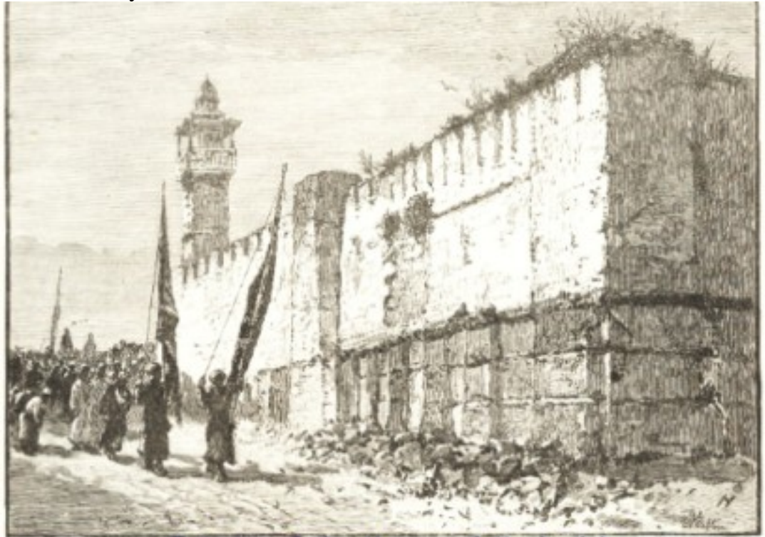
Exterior of the Mosque of Machpelah

number of the townsmen were, as usual, in the open space at the gate—the great gossiping haunt of Eastern buyers to-day; and the crowd which the patriarch gathered round were ready to entertain his proposal, though, with true Oriental dexterity, prompt to veil their keenness to sell under an air of courteous liberality. "He was 'a chief of God' among them; the choice of their sepulchres was at his disposal: none of them would withhold his sepulchre from him." But he knew too well what all this meant. He was aware that