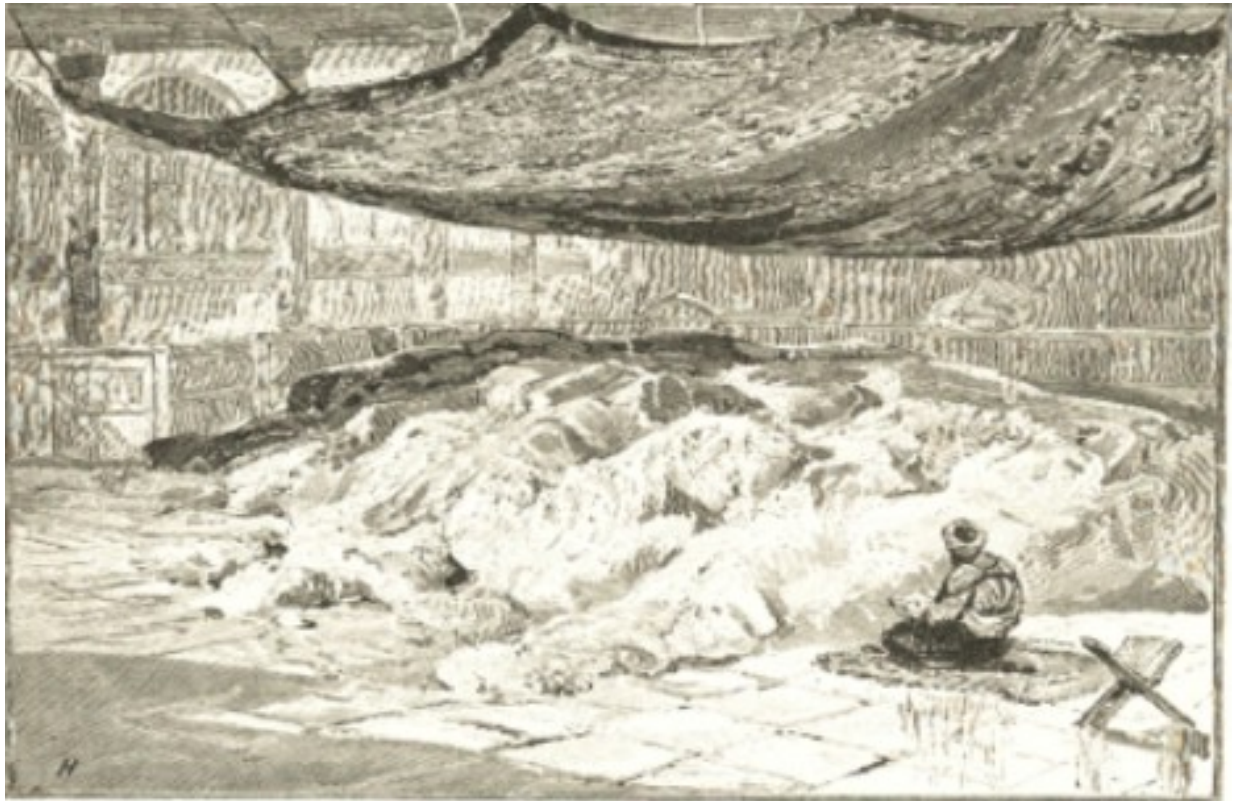
"Hump of Rock" in so-called Mosque of Omar

All this exquisite taste and lavish munificence is strangely expended in honour of a hump of rock, the ancient top of Morah, which rises in the centre of the building, within the second screen, nearly five feet at its highest point, and a foot at its lowest, above the marble pavement, and measures fifty-six feet from north to south, and forty-two feet from east to west. Had the mosque been raised in honour of the