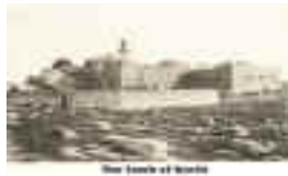
The Tomb of David Click pic for larger view

Near the cemetery is an old Christian church, the successor of one which stood on Mount Zion before the erection of the Church of the Sepulchre; that is, at least as early as 300 years after Christ's birth. In the times of the Crusaders apparently it was rebuilt, but in its present form it dates only from AD 1333, when it had come into the hands of the Franciscans. For 300 years back, however, the Mahommedans have taken it into their possession, and they guard what they think its more sacred parts with almost greater jealousy than they show about the so-called Mosque of Omar. The Tomb of David was one of the holy places in the church as long ago as the reign of the Frankish kings, and it is still claimed as a glory of the spot by its present custodians, who say it is underground, and let no unbeliever see it. Probably there are ancient tombs below the present surface, but this is not apparently the place to look for the tomb of the Psalmist-king. A long, bare room, up a flight of steps in the building, is, however, open, on payment of a small fee, its attraction being the tradition that here Christ ate the Last Supper with His disciples. But the Jerusalem of Christ's day, I need hardly repeat, is buried below thirty feet of rubbish.