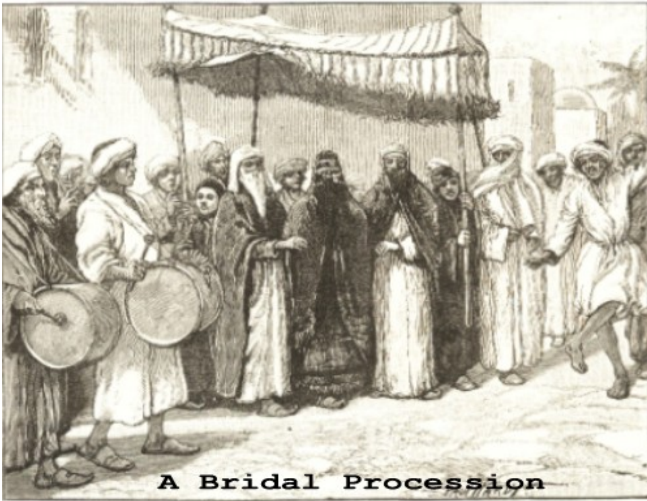
A Bridal Procession

father, for dowry, a valley in which there were springs, known as the Upper and Lower, is delightfully told in Judges. As she was being brought home, she urged her husband to ask her father for a field; but he appears to have lacked the courage to do so, or perhaps his bride seemed dowry enough in herself. She, however, was