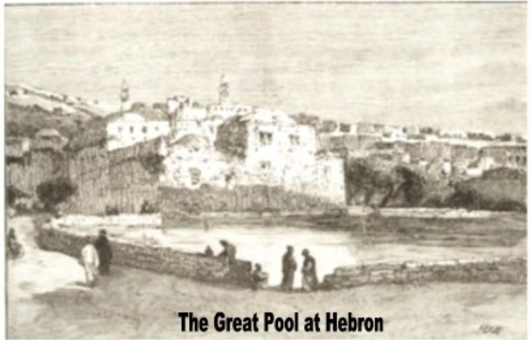
The Great Pool at Hebron

At last we rode down a slope between stone walls, interrupted by a few two-storey stone houses at the sides of a broader road, figs and olives filling most of the space on either hand, and, turning sharply to the right, were before one of the gates of Kiriath Arba, as the ancient Hebron was once called. This old name probably meant "the City of Arba," some old Canaanite hero; but it was explained by the Jews as meaning "the City of Four"—Abraham, Isaac, Jacob, and Adam, who were all