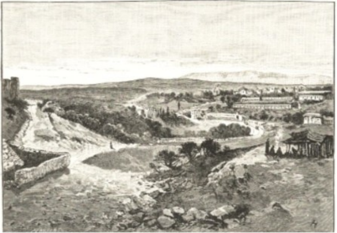
The Bethlehem Road from Jerusalem, showing Montefiore's cottages and the Jewish settlements

The road sank very gently from Mar Elias towards the north, and presented the very unusual sight, in Palestine, of gangs of men at work to make it passable for carriages. Levelling, filling up, smoothing, were all in progress; the labourers swarming, in turbans, fezzes, wide "abbas," or close cotton shirts, and bare-legged, in all directions. Such a phenomenon, in any part of the